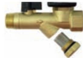
Integrated strainer with filter