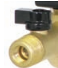
Dual inlet design

* For other requests/specifications please see FLUIDRAIN or EZ1 ranges.